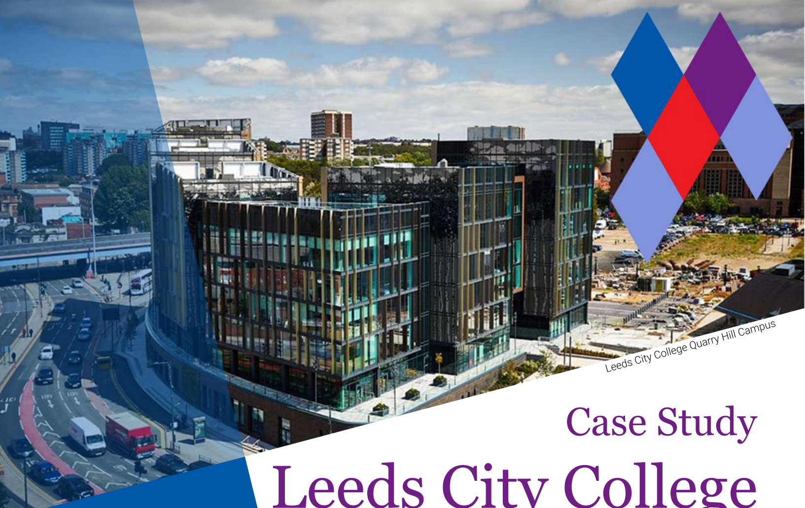
Leeds City College Quarry Hill Campus