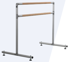
Small • length of barre 132cm (51.97") • weight (approx.) 9kg