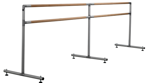
Large • length of barre 360cm (141.73") • weight (approx.) 20kg