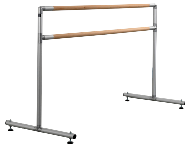
Medium • length of barre 182cm (71.65") • weight (approx.) 12kg